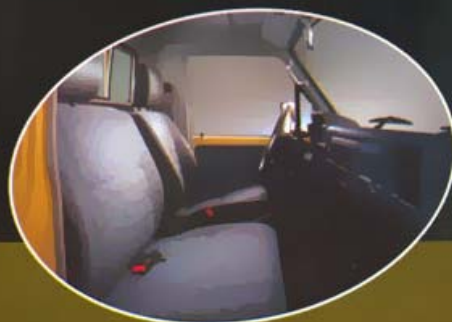
Separate seats are optional on Super-Long Wheelbase, Pick-up, and standard on Middle Wheelbase FRP top.