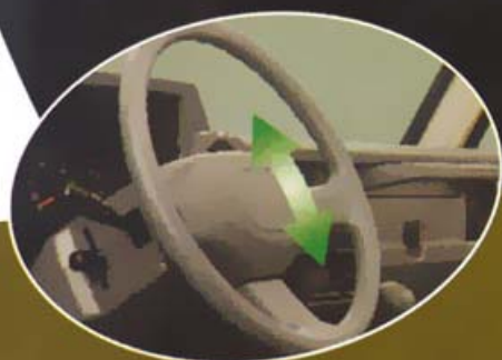
Tilt-adjustable steering wheel according to the position desired.