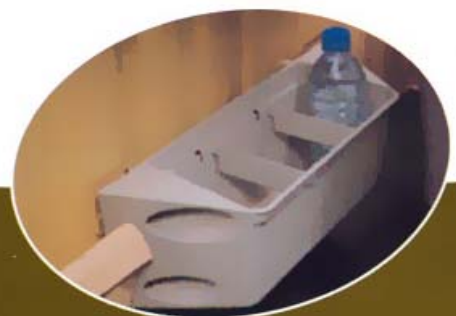
Bottle holder at the rear of the vehicle.