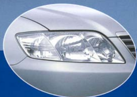
Stylish New Head Lamps