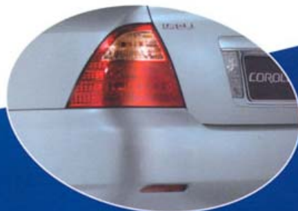
New & Refined Back Design