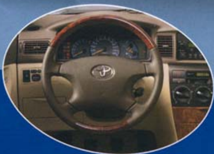
Easy Operation Displays & Switches