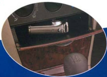
Convenient Storage Compartments