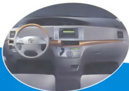
Instrument panel designed with maximum functionality and user friendliness in mind