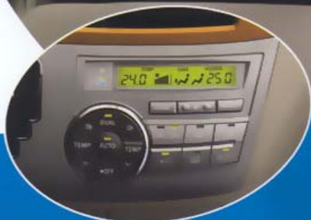
Powerful Air conditioner making your driving experience pleasurable everytime