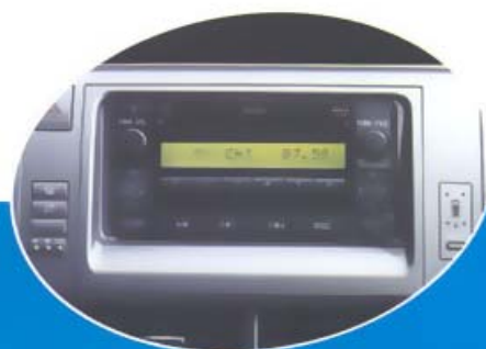
Genuine Toyota entertainment unit with CD player