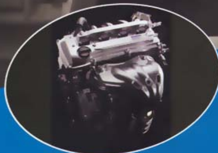
The powerful 2.4 litre V6-i 16 valve petrol engine's responsive power is balanced by the low fuel consumption and superb emission control